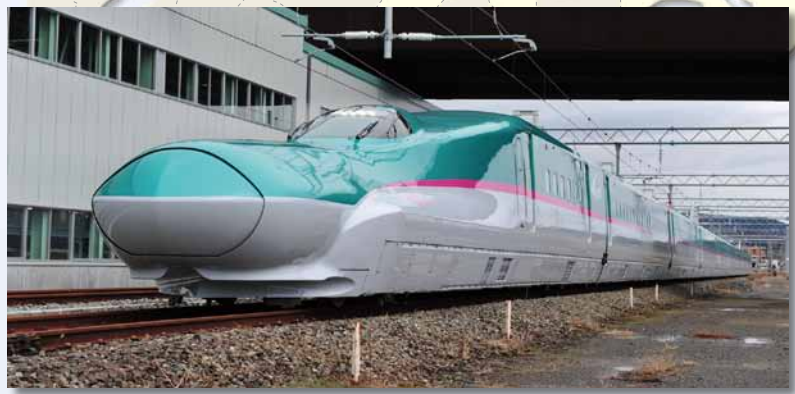
E5 series Shinkansen rolling stock (full production trainset)